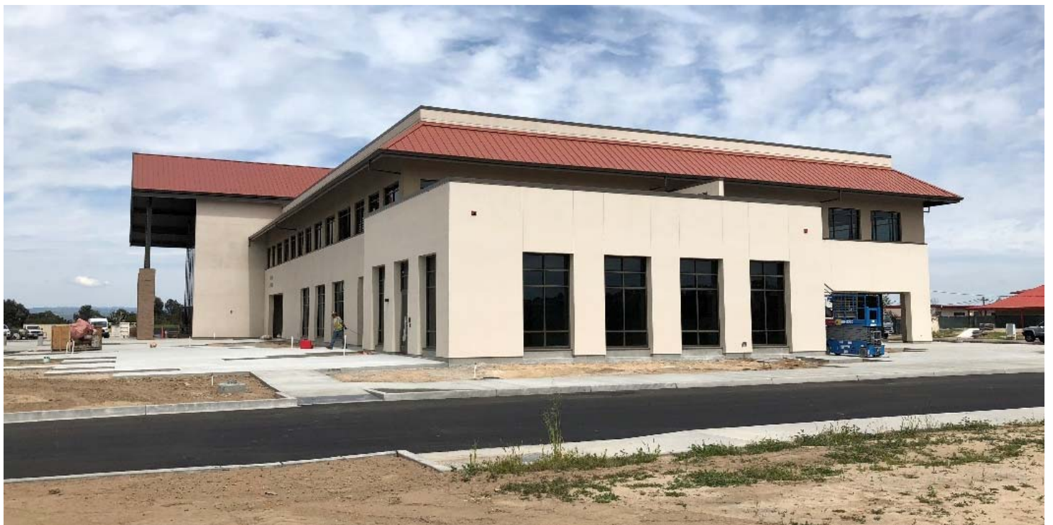
Exterior Building & Site Work Progress