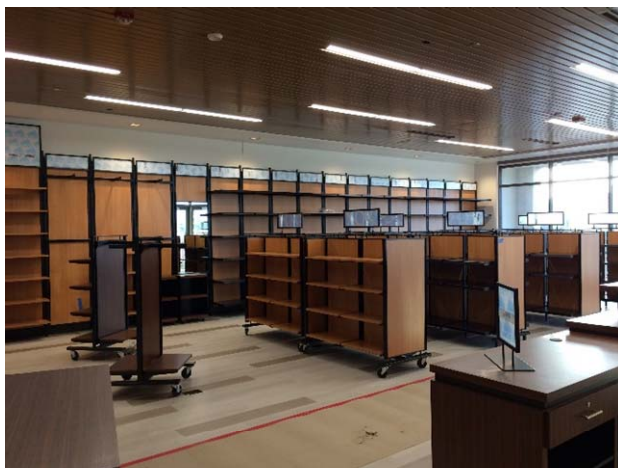
Bookstore Furniture Installation

Heading into the final month of the project, the contractor's onsite storage containers and offices have started to be removed. Next month, the grading contractor will clean-up the site and remove the construction entrance rock. Temporary fencing will be removed the week the District's takes occupancy which is scheduled for May 25 th . Planting and irrigation will begin at the beginning of next month.