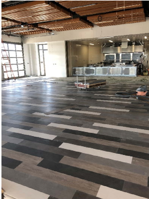
Cafeteria & Serving Area