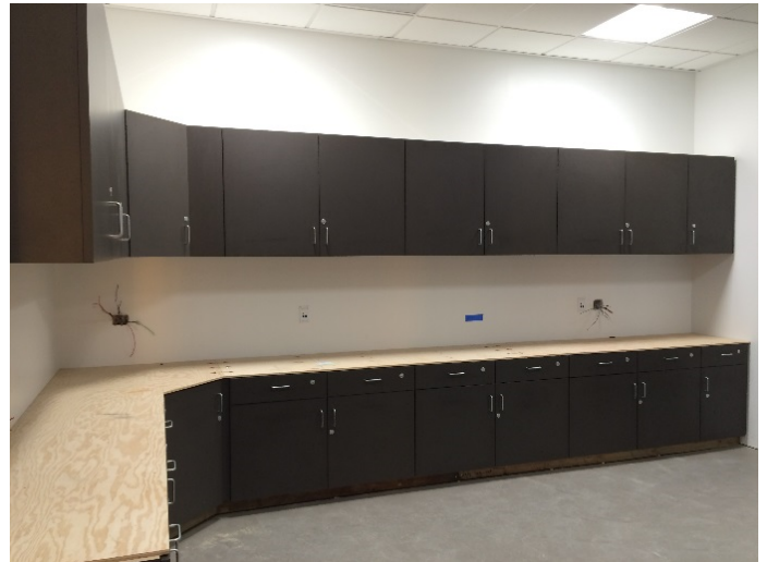
First Floor Workroom Casework