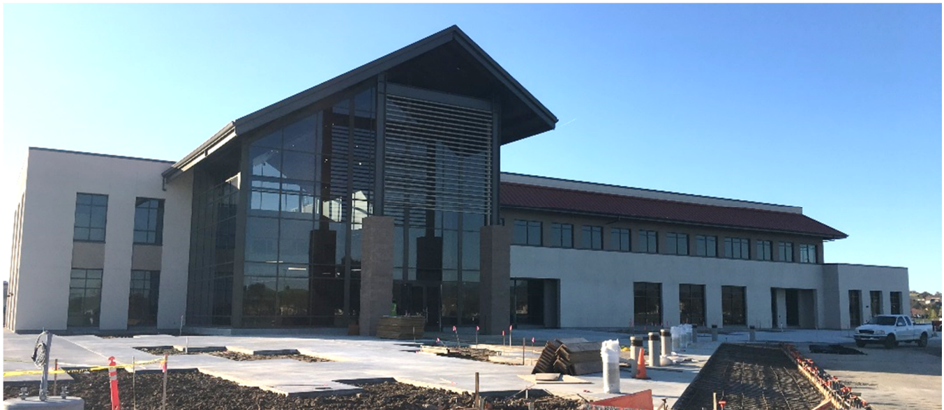
Main Entry Progress

As the project is nearing completion, the contractors are finishing up their remaining items. Items such as finishing ceiling tile and carpet in the remaining rooms, countertops and plumbing finishes. The kitchen floor tile has begun installation and kitchen equipment will follow. The building's furniture is scheduled for delivery into the building in April with installation beginning on the second floor.