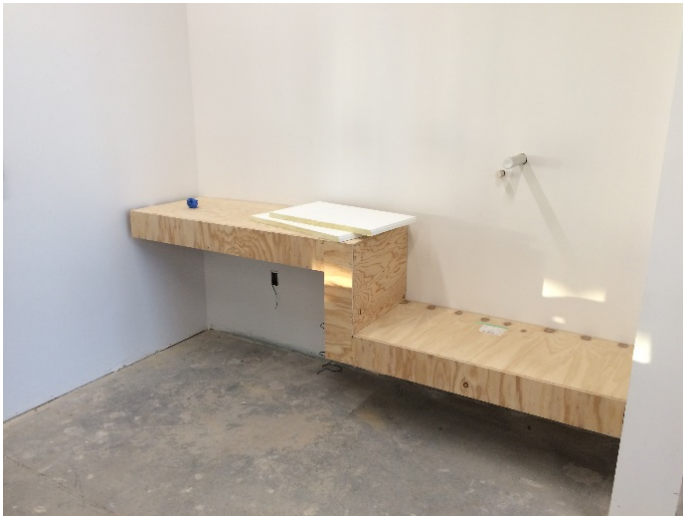
First Floor Drinking Fountain