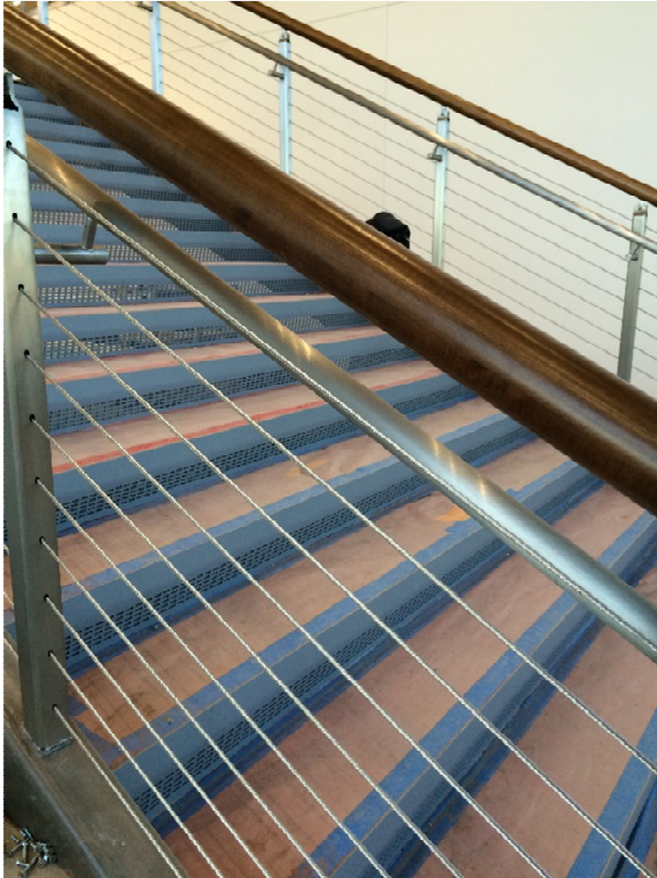
Interior Stair Handrail