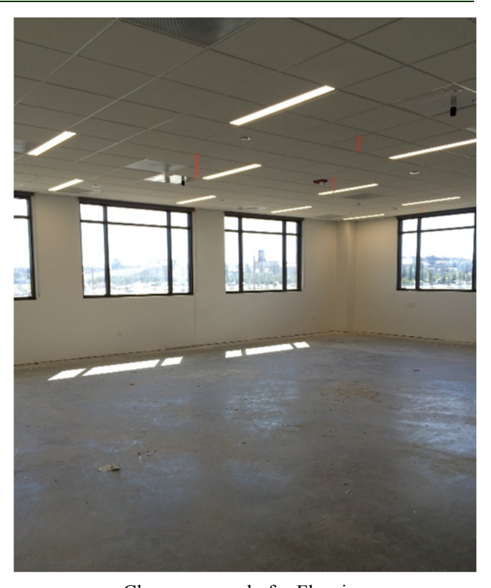
Classroom ready for Flooring