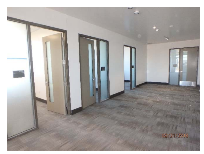
Carpet Installed on the Second Floor