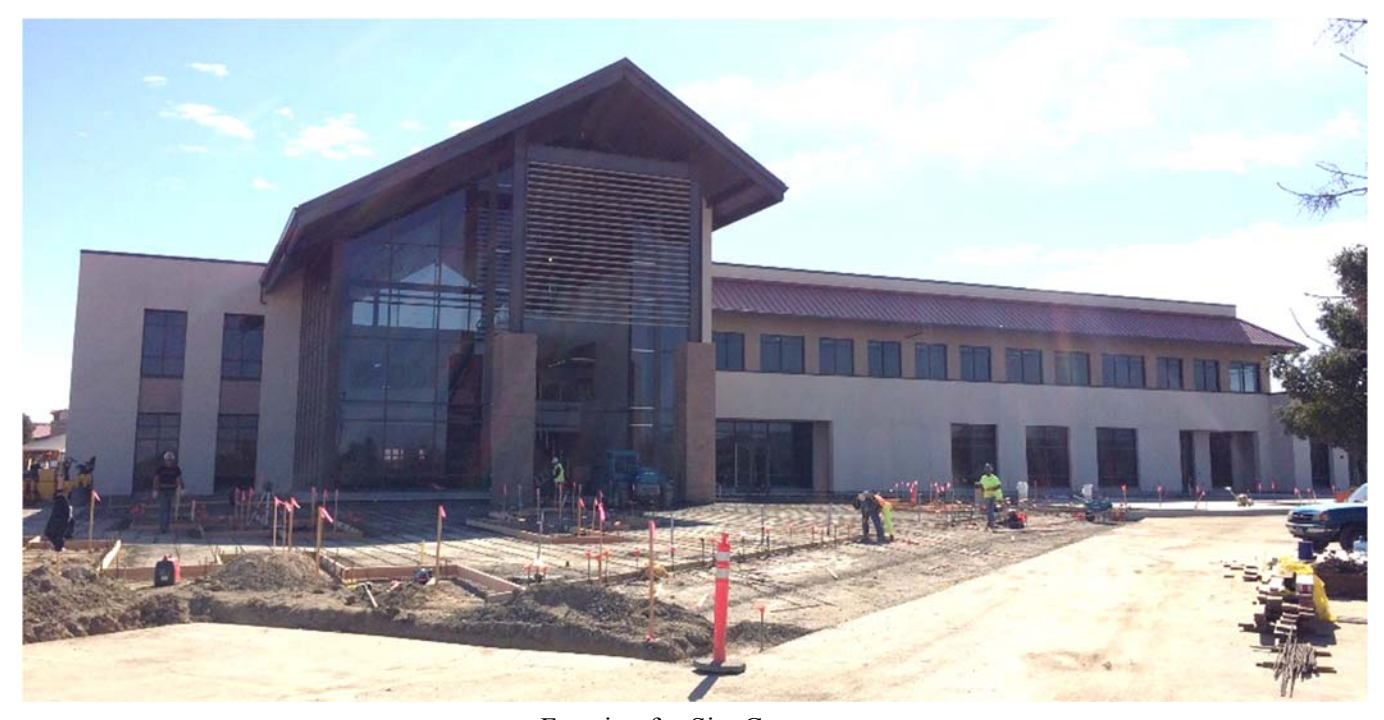
Forming for Site Concrete