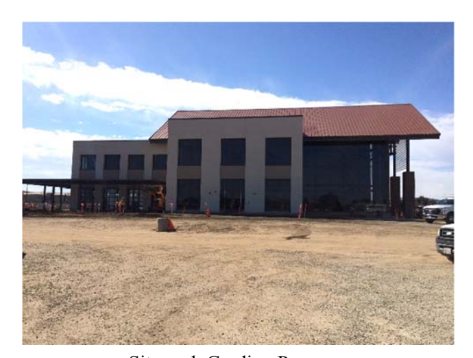
Sitework Grading Progress

As the month continues, all interior and sitework activities mentioned above will continue. Once the curtainwall is completed and the building is closed in the casework will be delivered and installed. The elevator pre-inspection has been scheduled for the last week of February.