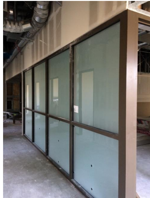
2 nd Floor Conference Room Glazing