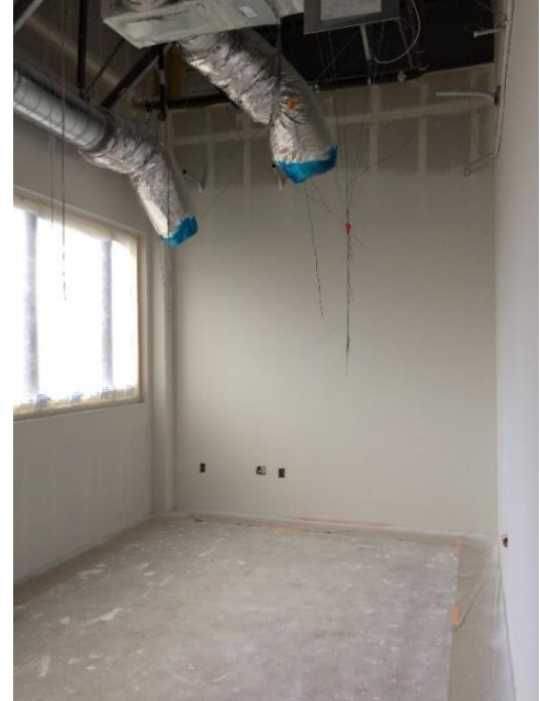
2 nd Floor Office