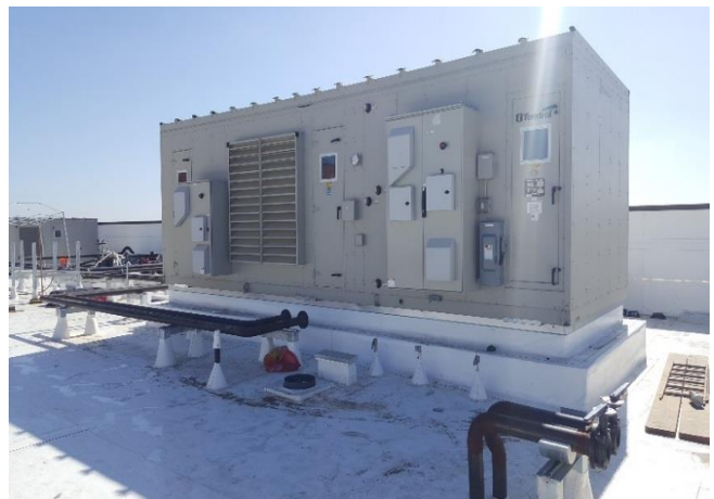
Air Handling Unit on Roof