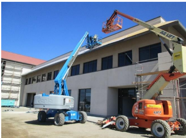
Mansard Standing Seam Installation

In the upcoming month, all interior finish work will continue. Walls are being closed up, then texture applied followed by finish painting. Site work continues around the building.