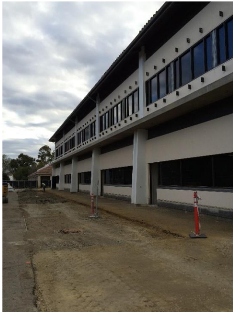
Site Grading on the North Side of the Building

Carpet is ready to be installed in the first floor classrooms. The site concrete will be starting in the upcoming month. Furniture will be delivered this month. The project remains on schedule to be completed in the late fall or early winter of 2017.