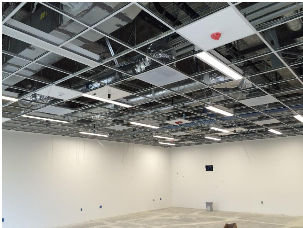
HVAC Registers, Light Fixtures, Fire Alarm & Fire Sprinkler Trim in the Ceiling Grid