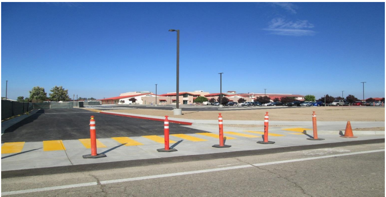
Site work Continues Within Fence line