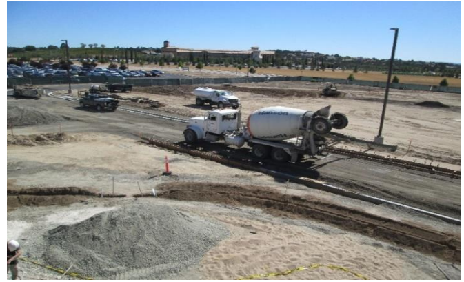
Curb and Gutter Work for Connection Between Parking Lots 10 and 11