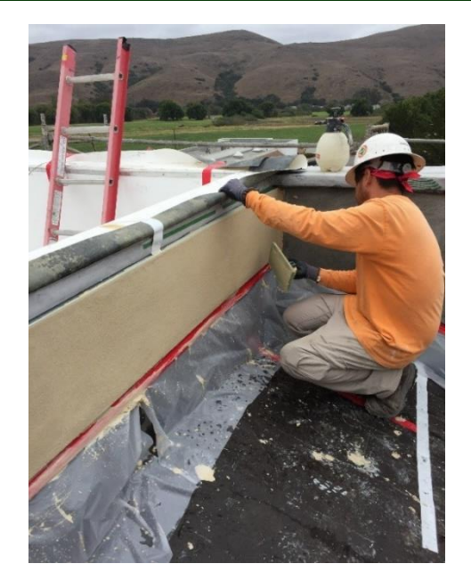
Roof Parapet Plaster