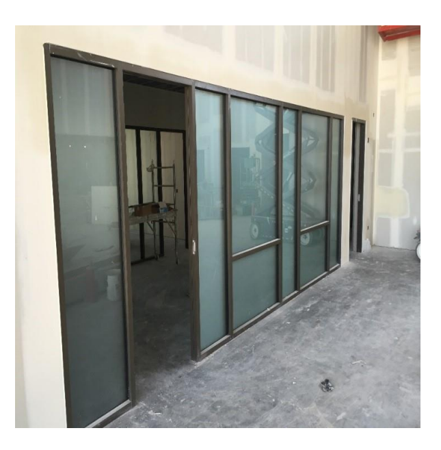
Second Floor Storefront Windows