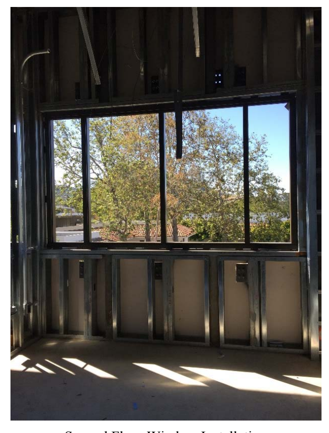
Second Floor Window Installation