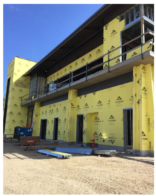
Exterior Columns with Sheathing in Place

In the upcoming month, the contractors will complete the weather barrier, a major project's milestone. Interior metal framing and drywall will continue throughout the month leading to the start of interior finishes early next month. The project is currently on schedule with construction to be completed late fall 2017 and move-in scheduled in the winter and open for spring 2018.