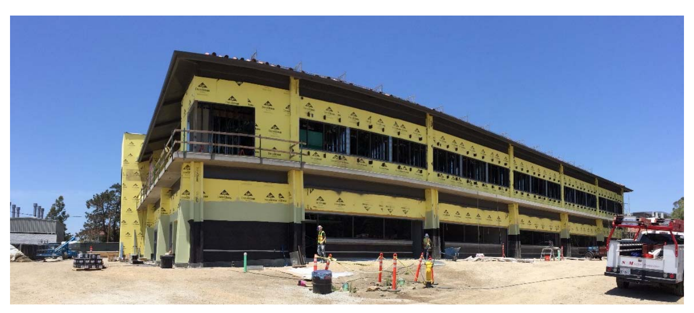
Exterior Progress from the Northwest Corner