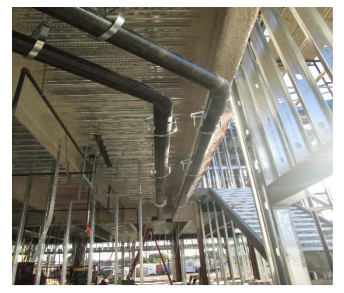
Welded Chilled Water Lines

During the month of May, the MEP Contractors continued to hang HVAC ductwork, install pipe and duct supports, run conduit and set boxes, and install plumbing and drain lines throughout the building. Interior and exterior framing also continued throughout the month and the exterior sheathing and weather barrier installation commenced. Earlier this month, the contractors started site work for the new entry approach on Dallons Drive. Lastly, the roofing material was delivered onsite and installation will start the first week of June.