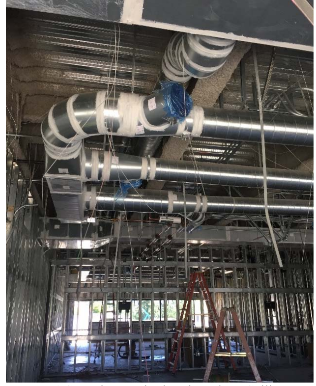
HVAC Equipment in the First Floor Ceiling

During the month of May, interior wall insulation was completed and drywall installation commenced. The first floor weather barrier also started around the exterior of the first floor. Metal framing continues on the first and second floor and is approximately 90% and 80% complete respectively and MEP rough-in is approximately 70% complete. Exterior windows on the second floor have commenced and the elevator was delivered earlier this month and installation is approximately 60% complete.