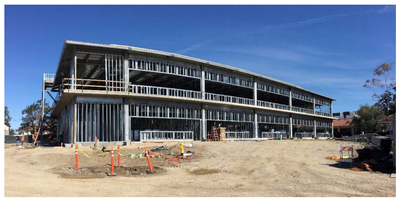
Exterior Framing Progress on the Southside of the Building