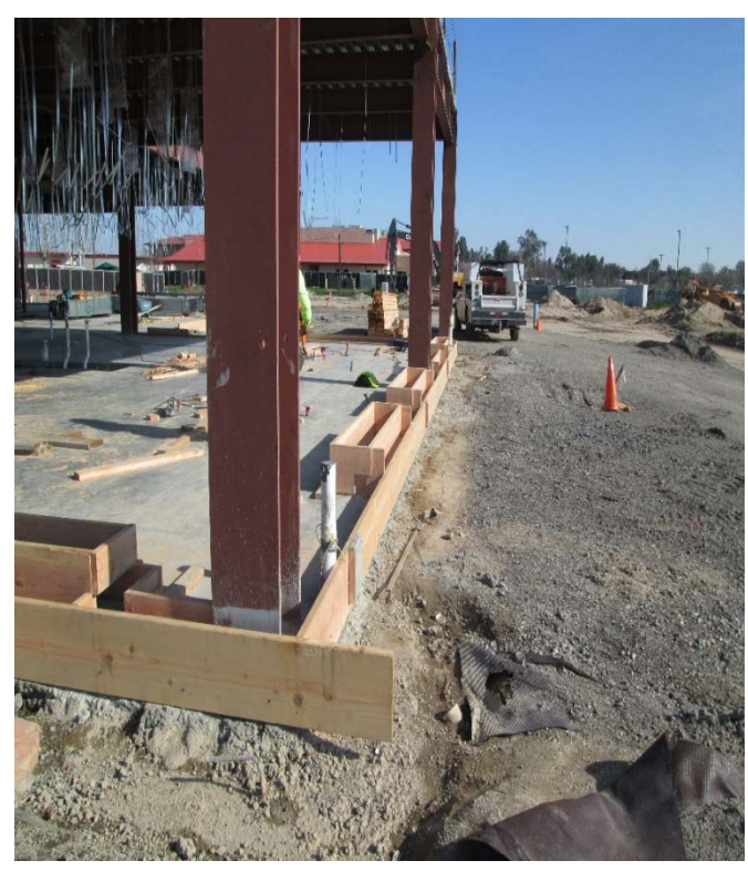
Formwork for Perimeter Curbs