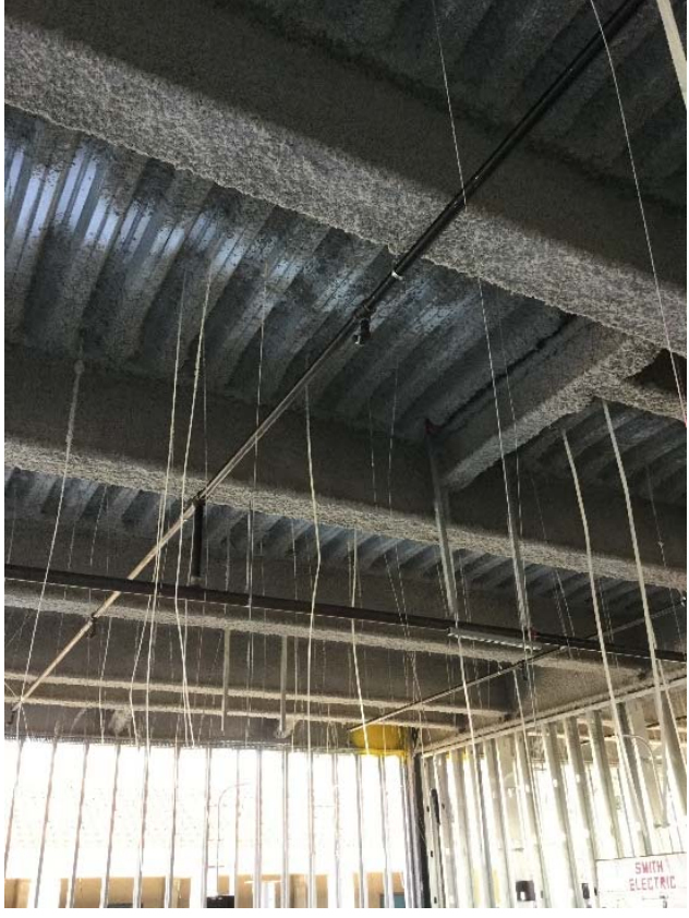
First Floor Fire Sprinkler Piping Rough-In