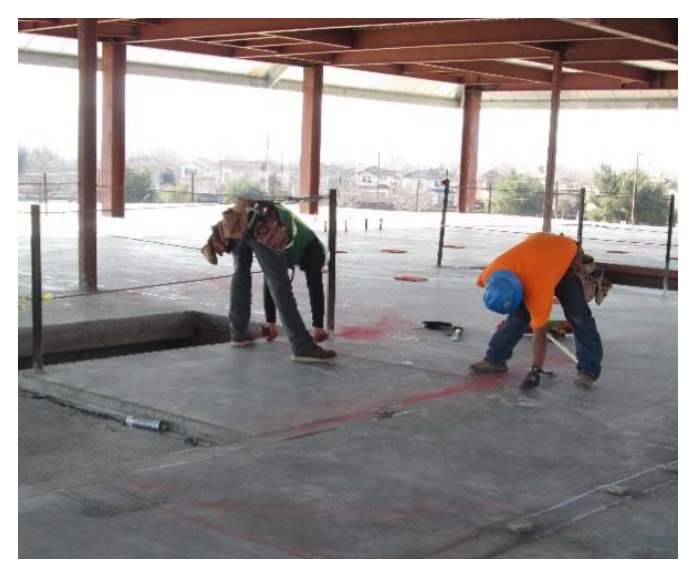
Layout for Interior Wall Framing