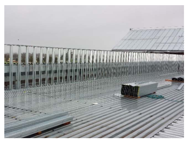
Roof Parapet Framing