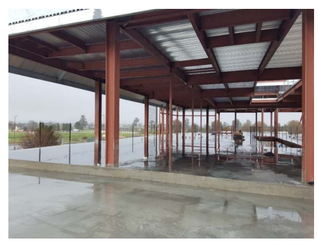
Second Floor Concrete Deck

In the upcoming month, the Concrete Contractor will complete the concrete curb installation at the first and second floors. The Structural Steel Contractor will install the exterior stairs and trellis and the Fire Sprinkler Contractor will begin with installation of the main line. The project is currently on schedule with construction scheduled to be complete late fall 2017 and move-in scheduled in the winter and open for spring 2018.