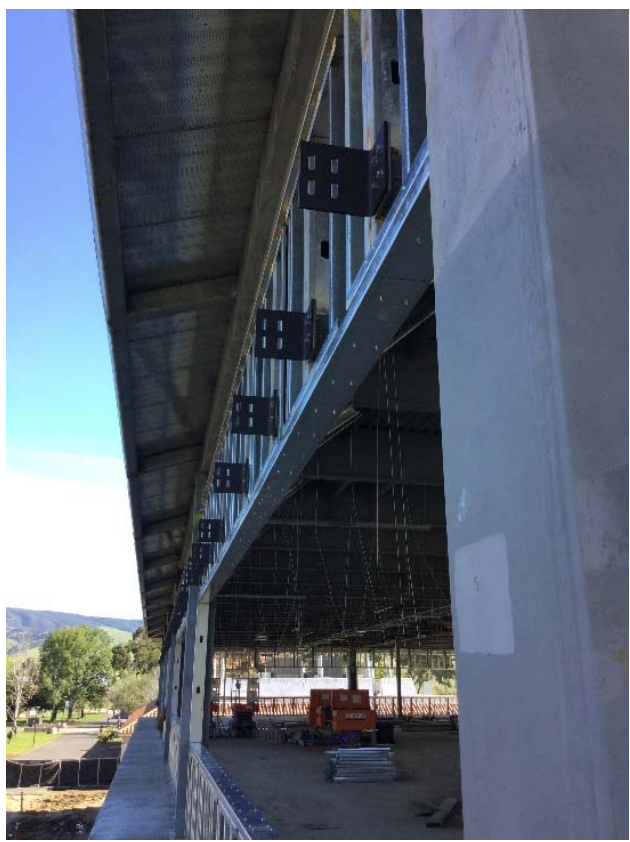
Aluminum Angles for Exterior Shadefins