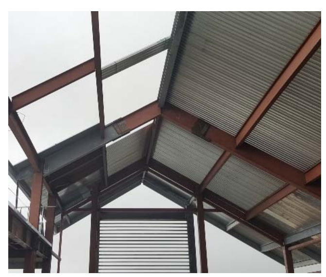
Decking at High Roof