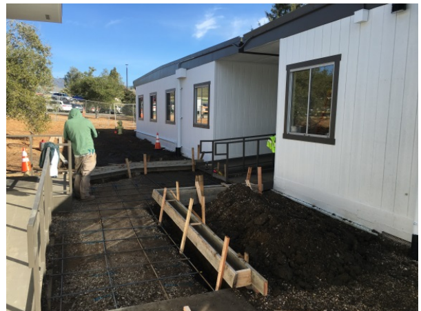
Installation of Rebar for Site Concrete