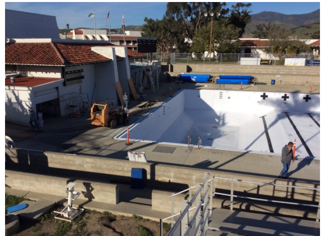
New PVC Liner at Deep End