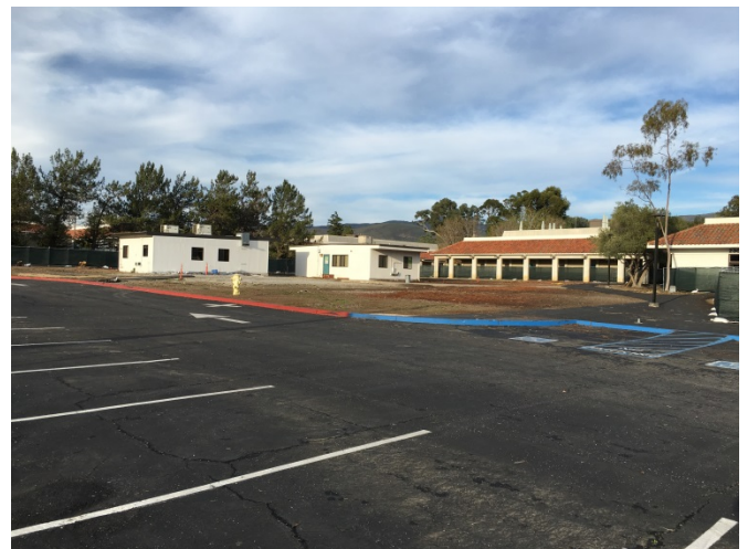
Remaining Portable Buildings