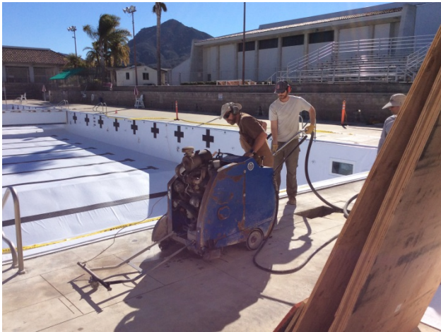
Concrete Saw-Cutting for Manifold Repair