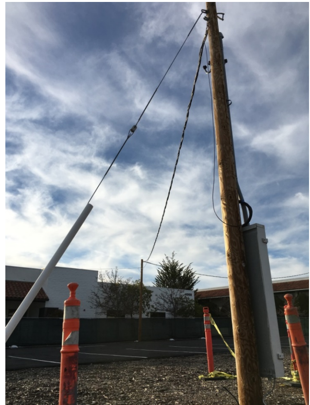
Temporary Construction Power

The project received DSA approval on 1/19/16. This project will initially go out to bid starting on 02/08/16 and bids will be opened on 03/10/16. Construction is anticipated to begin in April of 2016 and completed in the Fall of 2017.