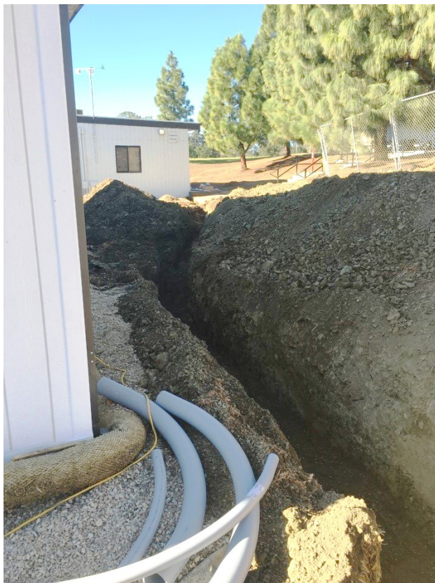
Site Trenching for Electrical Utilities