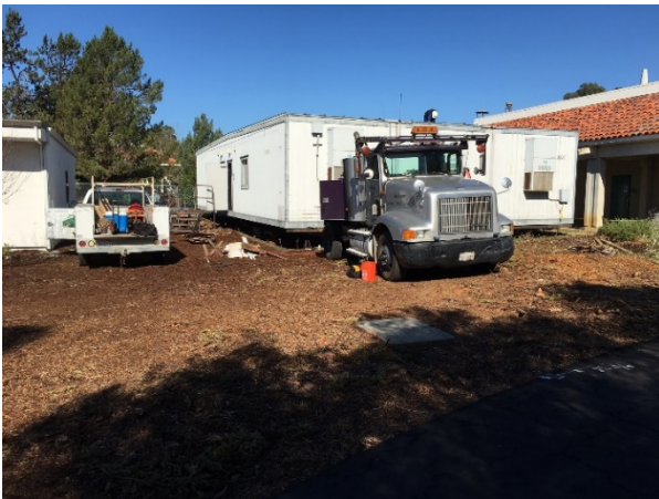
Portable Building Removal