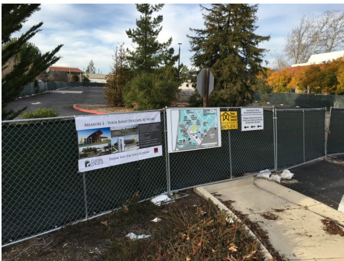
Perimeter Fencing and Way-finding Signage

Some demolition work has been completed including the electrical, plumbing, irrigation, and fire alarm safe-off of all existing portable buildings. Demolition of the existing wood deck between the old portable buildings is complete. Additionally, (3) of the (5) existing non-complaint portable buildings have been removed. The grubbing and clearing is complete and perimeter construction fencing has been installed, along with the way-finding signage. Temporary power for construction and temporary student pathway lighting is also complete. The Program team is assembling the public bid documents to be advertised early next month with the anticipation of starting construction over Spring Break.