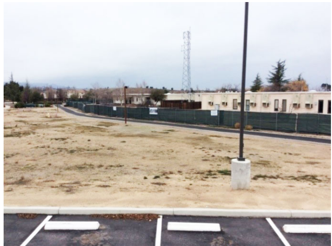
Temporary Walkway between Parking Lot 10 & 11

The parking stalls closest to the temporary student walkway from Parking Lot 10 (off Buena Vista Drive) to East side of campus are being converted into additional ADA parking stalls. MFPC began demolition of the existing walkway and vegetation on January 14, 2016 and began grading to achieve the ADA required slopes for the new walkway.