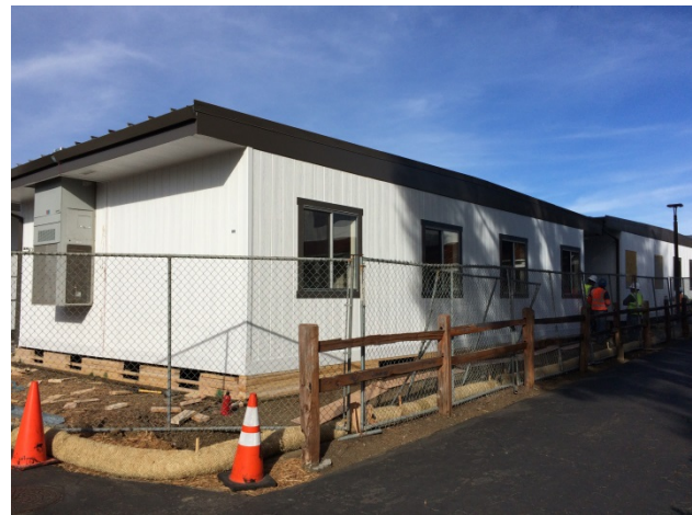
Setting of New Portable Buildings

The paving contractor has completed the initial grading of the site in preparation to receive the buildings. Class Leasing has delivered and set the two portable buildings. The buildings have been fit with electrical and data systems. The remaining work prior to completion includes additional site grading to ensure proper drainage around the buildings and a few miscellaneous items required prior to the final punch-list walk.