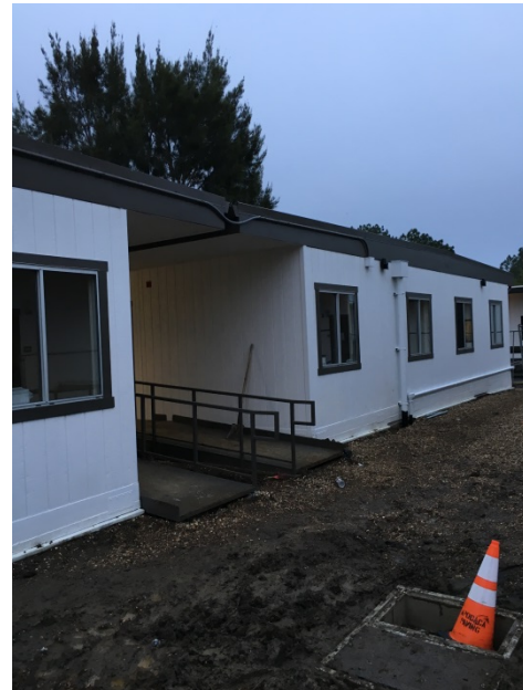
New Portable Buildings Prior to Site-work

Through January of 2016, (5) Requests For Information have been submitted and (0) remain in review. The Contractors have submitted (11) submittals to the architect and (0) remain in review.