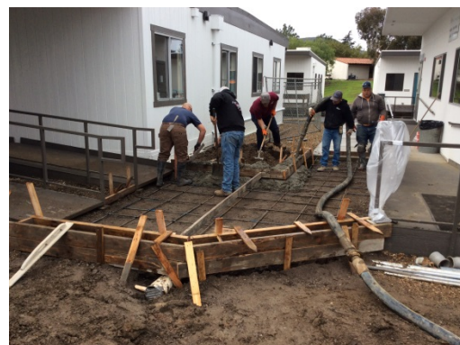
Placing Site Concrete