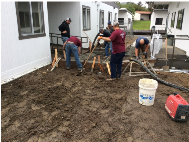
Installation of Rebar for Site Concrete