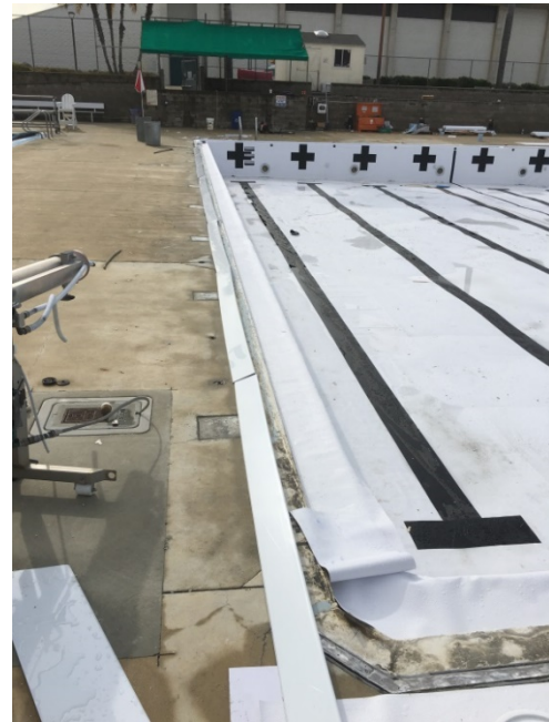
PVC Installation at Gutters