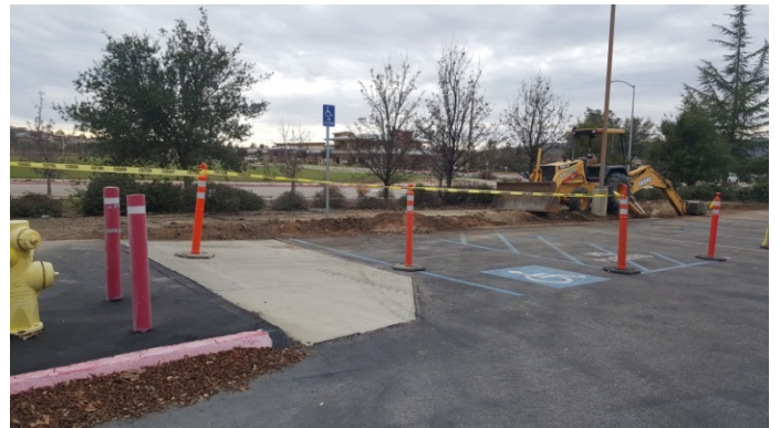
Added ADA Parking Stalls (Above and Below)