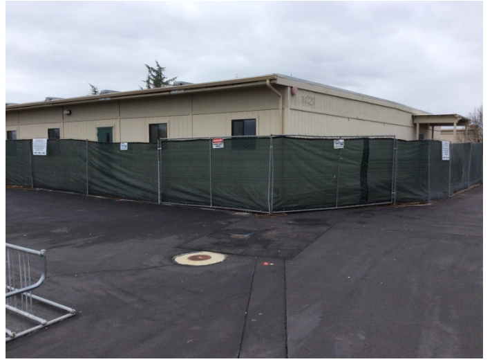
North County Campus Center