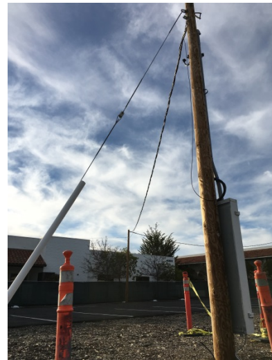
Temporary Construction Power